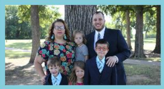
"Come over... and help us." Acts 16:9